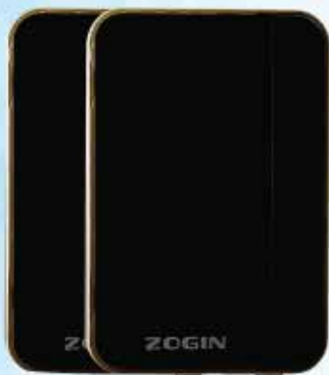
WIRELESS DOOR BELL RECEIVER