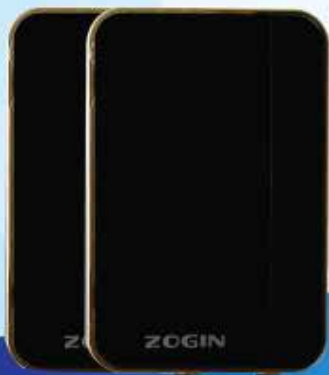
WIRELESS DOOR BELL RECEIVER