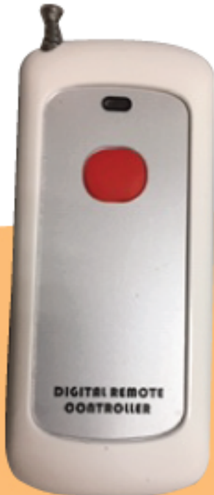
Remote WIFI Controller