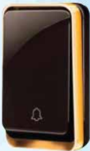
WIRELESS DOOR BELL BUTTON